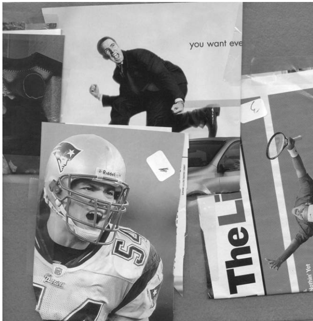
FIGURE 2 TIM'S SUMMARY IMAGE

This intense and ongoing cycle is what helps casino gamblers reignite their desire. In contrast, our data suggest that online gamblers do not go through the same level of emotional preparation as they get themselves ready to play online. That is, they do not ignite a major “fire of desire” like the casino participants do. We believe that this difference contributes to a muted reaction to the outcomes of online gambling. Indeed, rather than discussing online gambling in highly charged emotional language, online participants describe it in rather mundane ways, likening the feeling to other passive behaviors, as Jessica does: